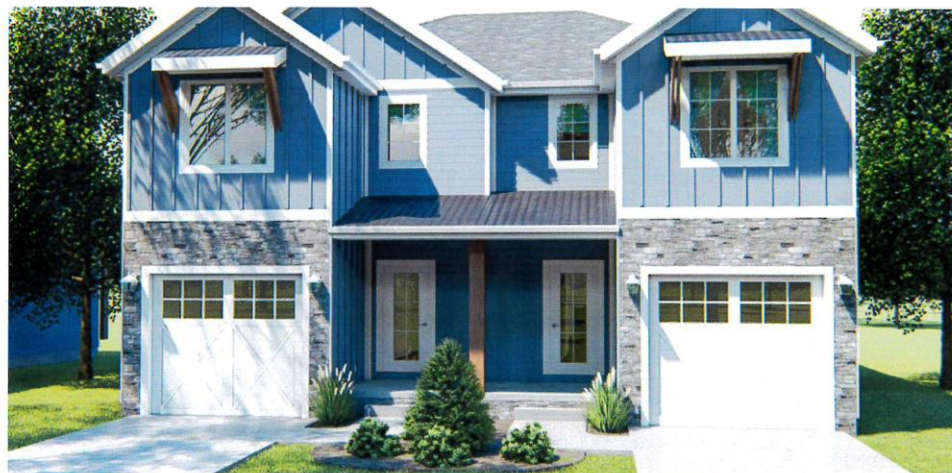
3 Bed Craftsman Narrow Lot Duplex House Plan