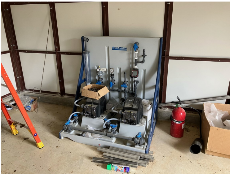
Top: Bio Unit #3