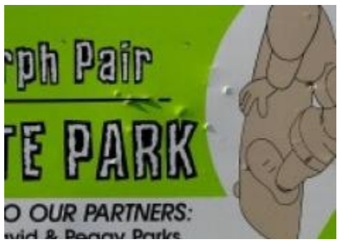
Murph Pair Skate Park