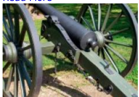
Prairie Grove Battlefield State Park