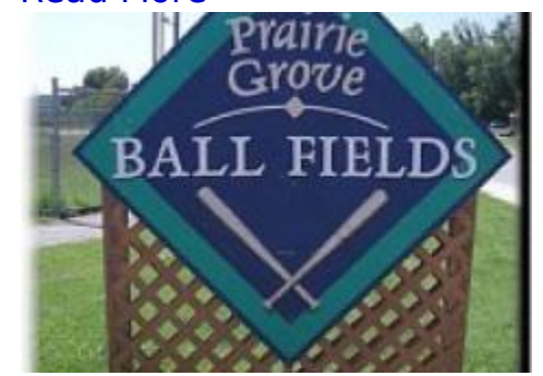
Baseball & Softball Fields

Baseball and Softball fields are located in Delford Rieff Park near the Aquatic Center. The concession stand is conveniently located central to the fields. In addition, the City utilizes 2 additional softball fields located directly behind the Elementary School on Viney Grove Road.