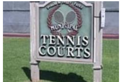
Donald & Peggy Parks Municipal Tennis Courts

The Municipal Tennis Courts are located on Hwy. 62 just north of downtown Prairie Grove.