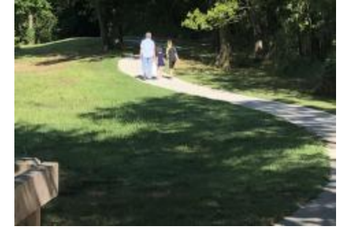
Muddy Fork Park

Muddy Fork Park is located at 951 Bonnie Scotland Drive, in the northwest part of town. It includes a beautiful paved walking trail, a natural surface trail that follows Muddy Fork Creek, fishing, a dog park and coming this spring, new restrooms and a new playground.